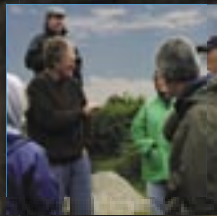
Natural history & Archaeology