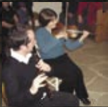
Music, song & dance